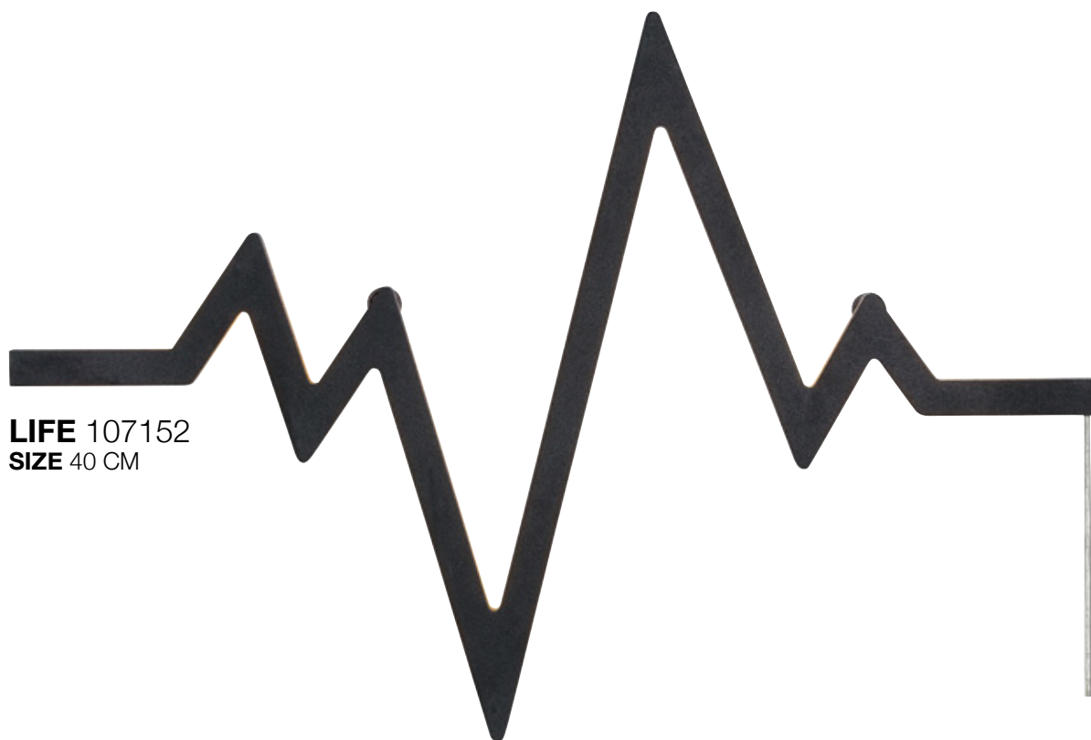
LIFE 107152 SIZE 40 CM