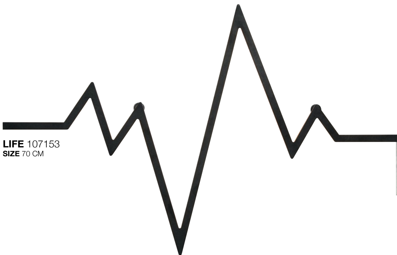
LIFE 107153 SIZE 70 CM